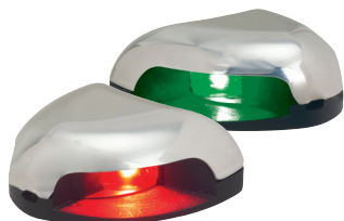
Fig. 0626 Side Lights