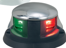
Fig. 0647 Bi-Color Light