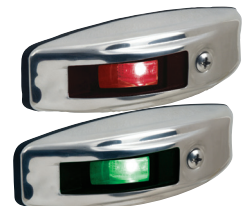
Fig. 0618 Vertical Mt. Side Lights

Figs. 0625, 0626, 0647 & 0648 Lights fit existing older style mounting footprints