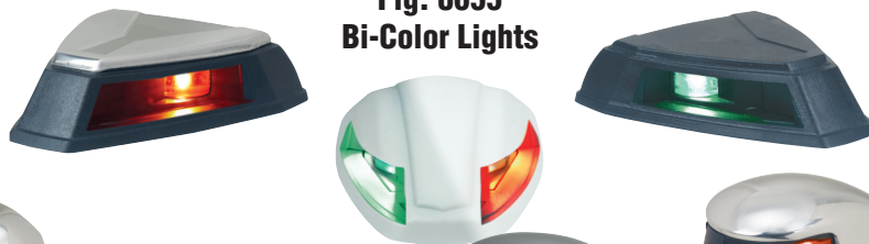
Fig. 0655 Bi-Color Lights