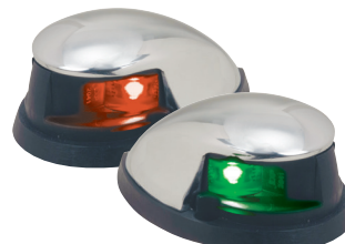
Fig. 0648 Side Lights